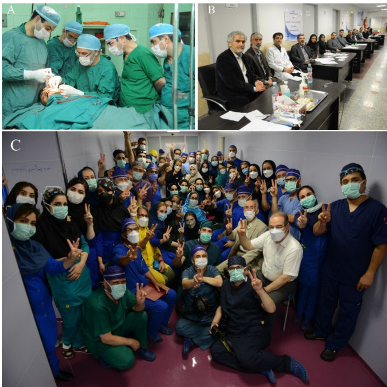
Figure 1: Our medical team. A. At the operating room, 1 st mission (Ramhormoz, November 2009), B. Prepared for initiating medical visit, 11 th mission (Bushehr, January 2014), C. At the operation room, 27 th mission (Tehran, June 2021)

purposes and releasing their photos, as necessary. All medical staff appearing in the photos also provided written informed consent for publication of their photos.